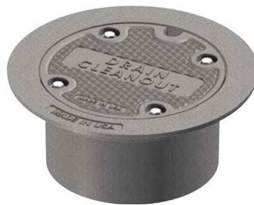
1716Z1 8" height frame illustrated