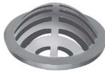
Type O Beehive Grate Approx. 140 sq. in. open area 5 1/2" height above frame