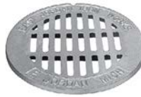
Type M Flat Grate Approx. 115 sq. in. open area